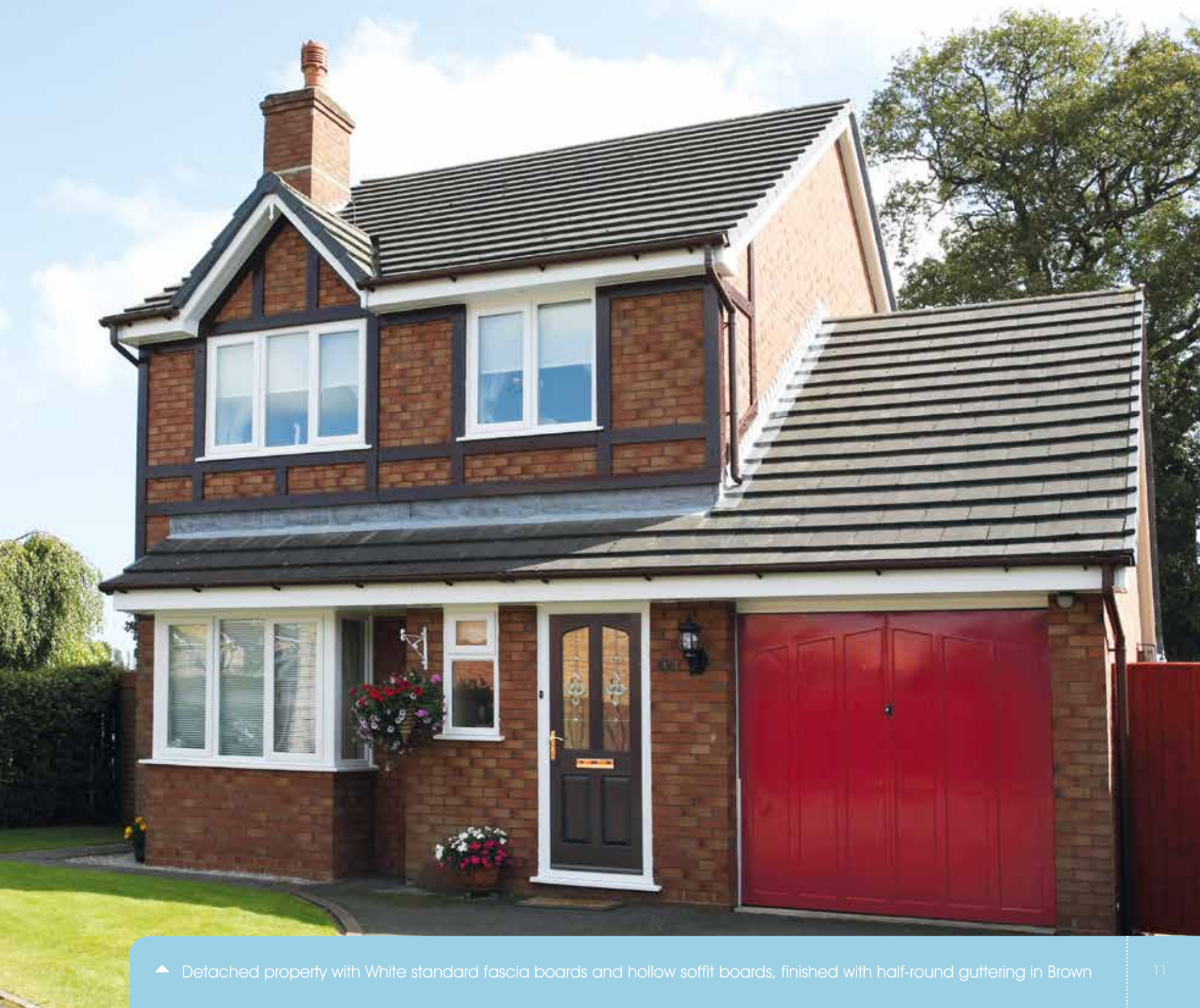
▲ Detached property with White standard fascia boards and hollow soffit boards, finished with half-round guttering in Brown