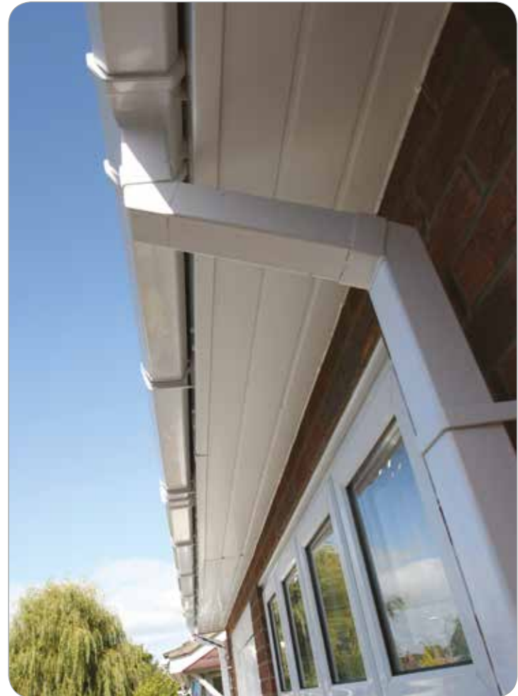
▲ Square-line guttering shown in White