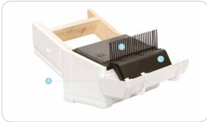
A roofline sample showing the 3 in 1 accessory used to enhance your roofline solution ▲