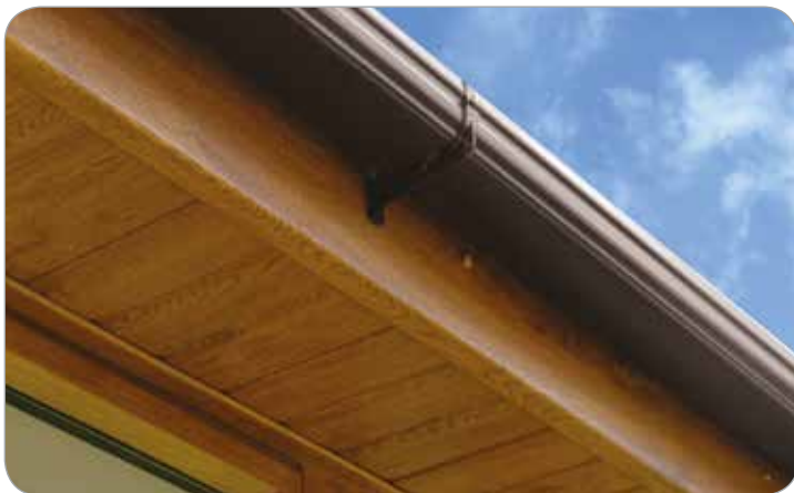
▲ Universal Plus guttering shown in Brown

Cream-coloured guttering is available exclusively from Eurocell in the Universal Plus style, while ogee styling gives you the option of a more decorative, sculpted finish.