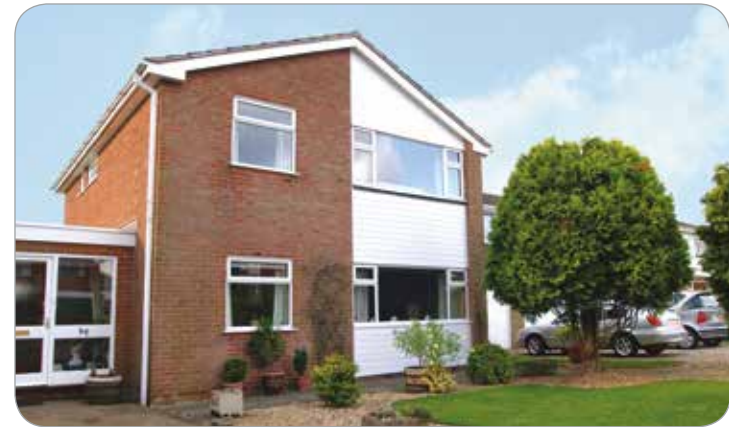
▲ Shiplap cladding in a horizontal formation, in White finish

In addition to these individually available items, there is a 3 in 1 solution (as shown above) which combines: A Over-fascia ventilation which sits underneath the felt tray, B Eaves comb filler and C In-built felt tray which prevents the roof felt from sagging and stops pools of water from forming.