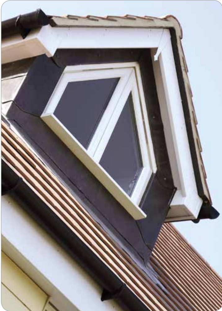
▲ Standard fascia boards and utility boards in White, featuring decorative finial