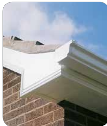
▲ Decorative Ogee style fascia boards in White finish