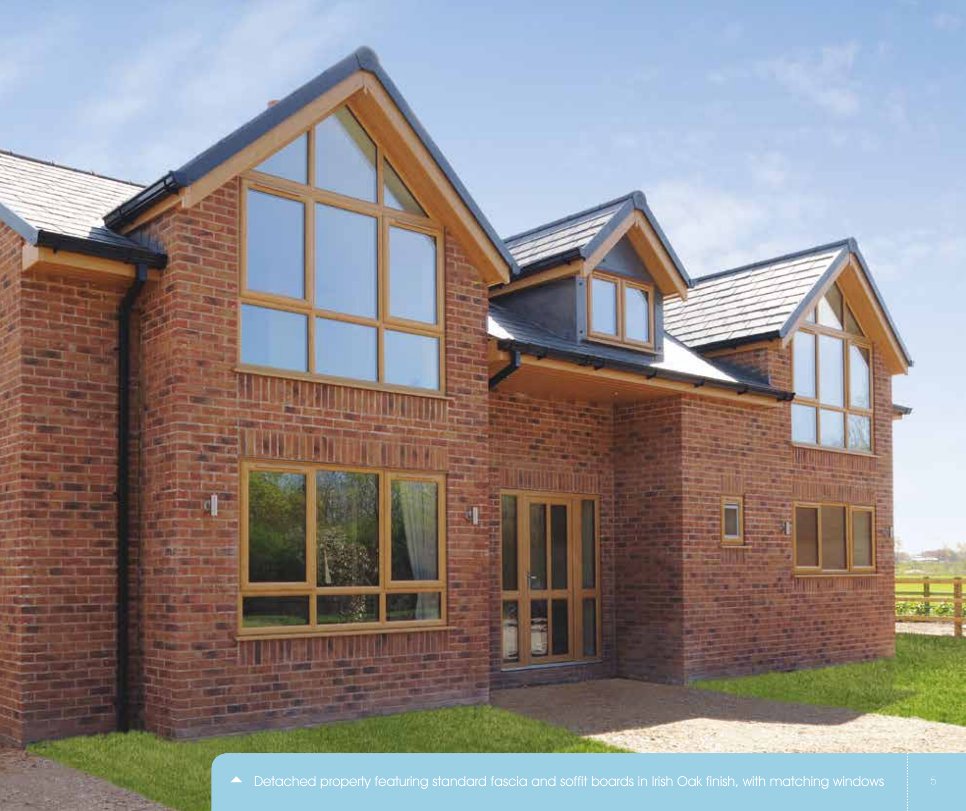
▲ Detached property featuring standard fascia and soffit boards in Irish Oak finish, with matching windows