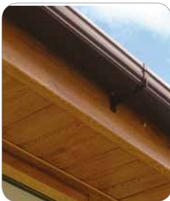
▲ Property with standard fascia boards in Golden Oak finish

You can also choose plain flat boards for a simple, contemporary look, or sculpted 'ogee' style options for a more decorative finish.